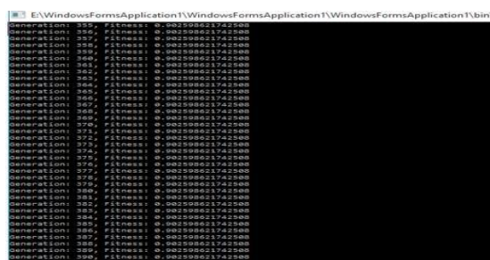
Figure 4: Road fitness function model

Figure shows the value of the fitness function which allows users to predict the future traffic volume analysis and the next population. It is generated on the basis of capacity and traffic volume forecast and results in estimates of future traffic. GA separates roads by its fitness function: if the value of fitness function of particular road is less than one then that road consider as fit i.e. under the capacity otherwise the road is unfit i.e. traffic goes beyond the capacity.